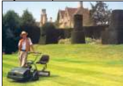
Atco Royale advertising photograph from the 1980s. Not too different from some of their shots from decades before in fact.