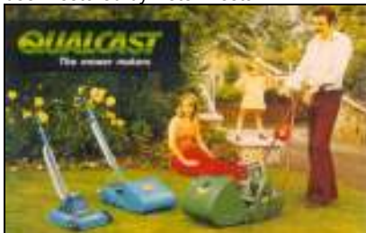
This Qualcast advert from the late 60s or early 70s shows some of the mowers from their "blue plastic" period.