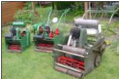
A selection of Automowers seen at Tilmow in 2006. The one in the centre is a 1920s model, the other two from the 1930s.