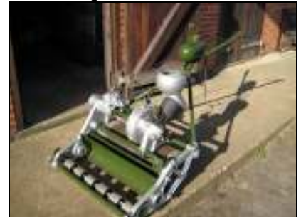
This water cooled JP is Dusty Miller's latest restoration project.