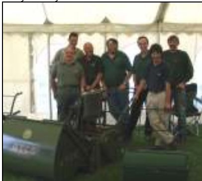
Some of the team at Bedfordshire Steam Rally in 2006. In fact it's four Hardwicks and three committee members.