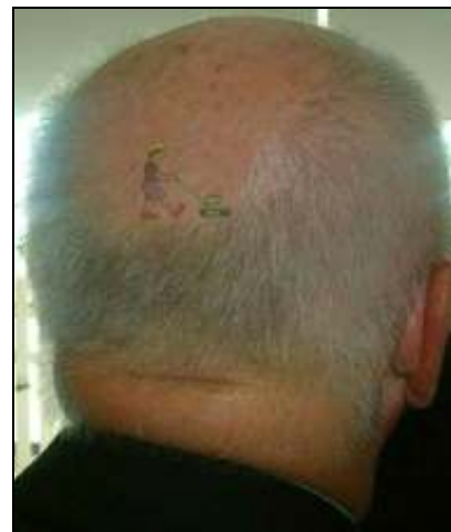
A number of members have spotted this image going around on the Internet. Some have speculated that it might be a certain club member but we're not convinced as he hasn't gone grey...yet.