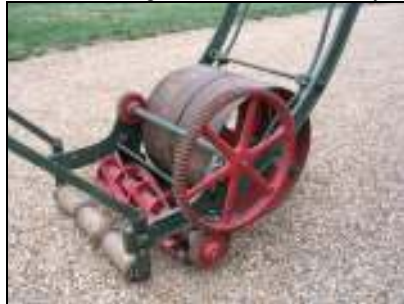
A close up shot of the Budding type mower at Milton Keynes Museum showing the gear assembly.