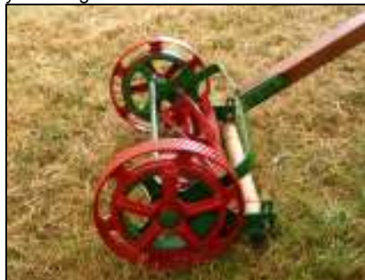
Arundel Coulthard of Preston made a number of machines using the "Presto" name. The roller mower is relatively common but the sidewheel is a little bit harder to find.