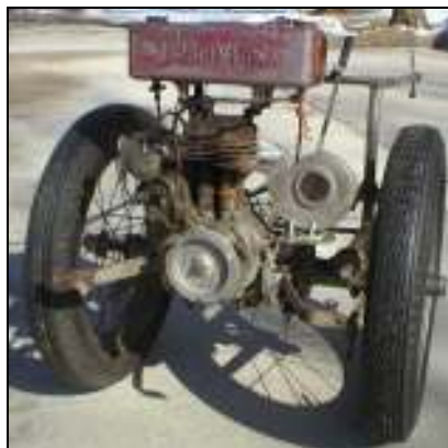
This is a Worthington Overgreen tractor unit from the USA. The design was made under licence in the UK by Ransomes and its Overgreen models were used for many years of golf courses.