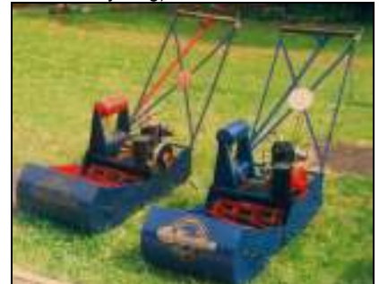
You won't see a Keynsham mower very often, let alone two together. It's one of the less common 1920s machines.