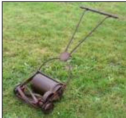
The Hall & Duck Trust's Chadborn and Coldwell hand mower won the Andrew Grout Plate at last year's Annual Rally.