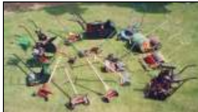
Christopher Proudfoot put together this display of mowers from 5" to 22" cut, one for each size. Anyone care to try and name them all?