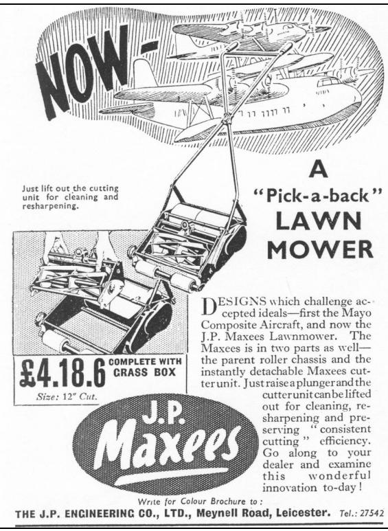
Advert for JP Maxees dated 1939.